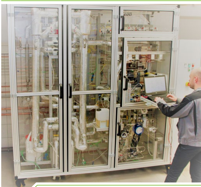
Small-scale pilot plant for synthesis of methanol / dimethyl

The progressive climate change necessitates a particularly efficient use of fossil resources and the integration of regenerative energy sources and biogenic materials into industrial value chains. The associated technological, economic and social challenges are enormous. Through application-oriented research and development, we support our clients on their way to a sustainable future. A holistic approach is taken to guarantee a well-engineered technical solution with outstanding product features, without losing sight of the ecological footprint, operating and investment costs as well as social acceptance.