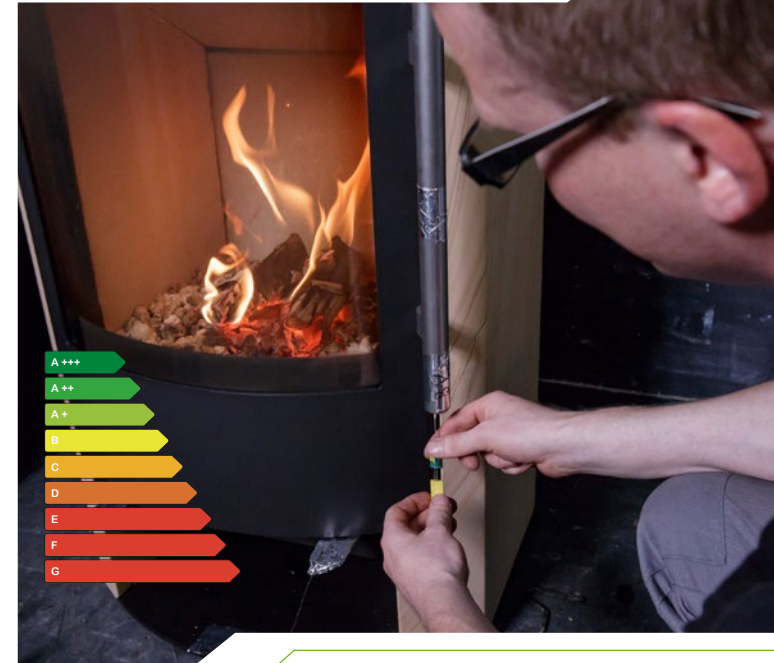
retrieved march 2017

Phone: (+49) 3731 4195-316 Fax: (+49) 3731 4195-319 rico.essbach@dbi-gruppe.de