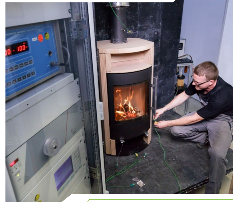
status: march 2019