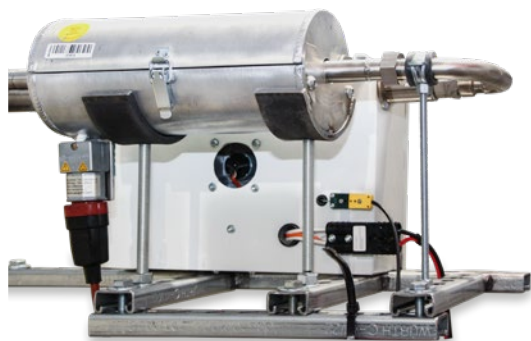
Probe equipment of the PME-measurement

As a matter of fact the limit values described in the Eco-design regulation for each PM measurement method are not comparable with each other.