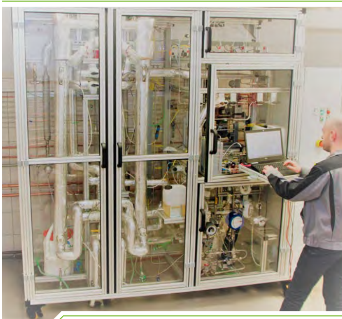
Small-scale pilot plant for synthesis of methanol / dimethyl

The progressive climate change necessitates a particularly efficient use of fossil resources and the integration of regenerative energy sources and biogenic materials into industrial value chains. The associated technological, economic and social challenges are enormous. Through application-oriented research and development, we support our clients on their way to a sustainable future. A holistic approach is taken to guarantee a well-engineered technical solution with outstanding product features, without losing sight of the ecological footprint, operating and investment costs as well as social acceptance.