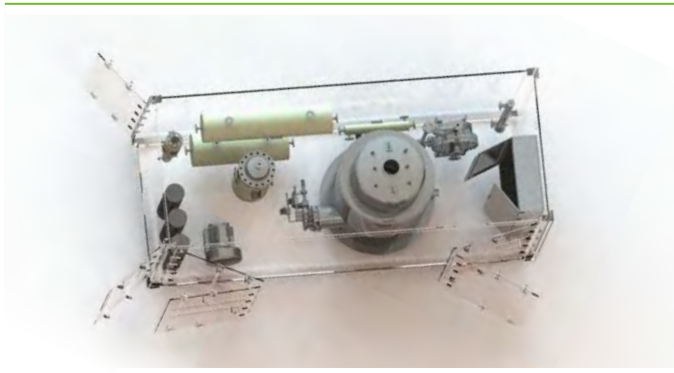
Container-integrated steam reformer, output: 100 m 3 /h hydrogen